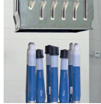
Encore HD-PE multi-gun arrangements for coating cavities