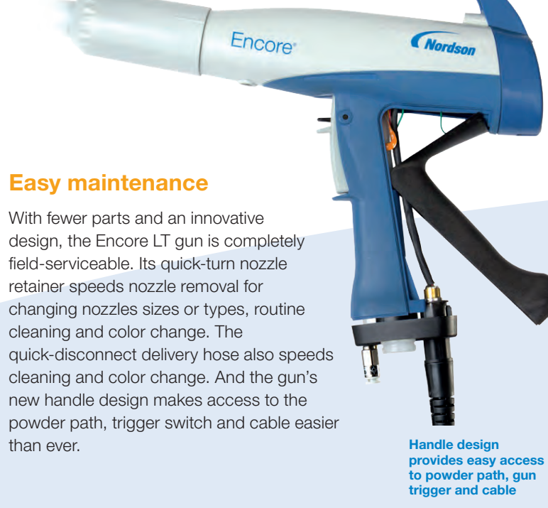
Easy maintenance with fewer parts